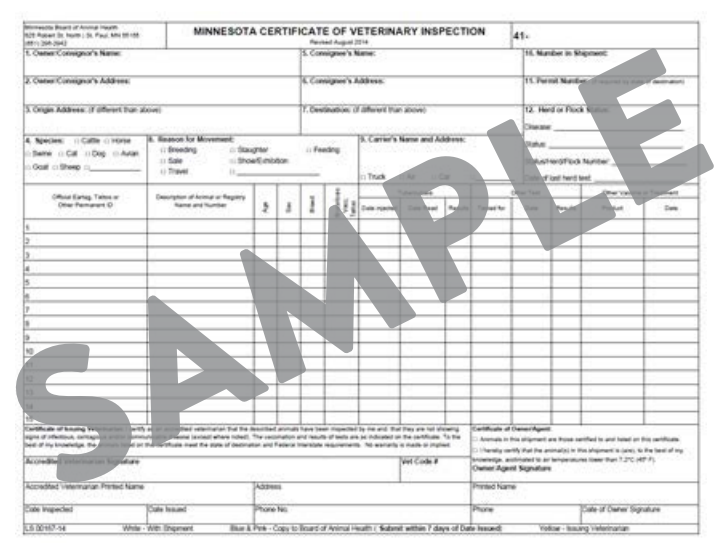
Sample of Certificate of Veterinary Inspection (CVI)